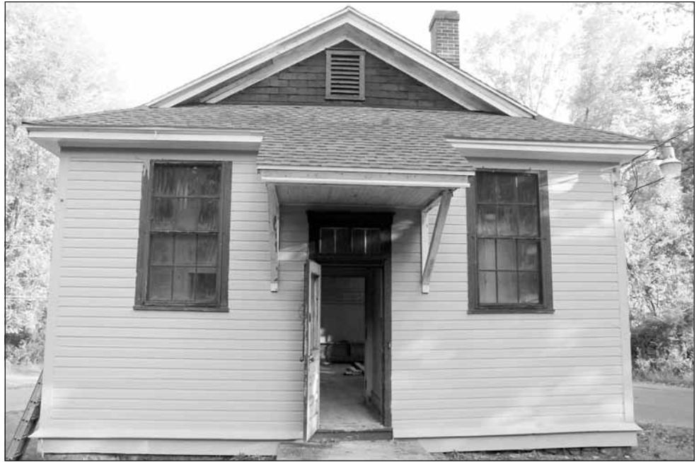
Restoration work will continue in the spring of 2018.

Volunteer help is critically needed. Are you interested in a short term volunteer project for 2018? If so, please consider helping on the Stanhope School Project. Days and hours are flexible to fit your schedule. All